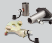
Brake cylinder pressure measurement taps meet AAR Standard S-4020.