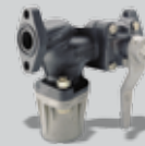
Dirt collector & cut-out cock