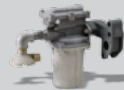
KM-2 vent valve utilizes a poppet valve design to provide superior and reliable venting.